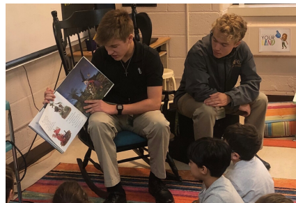
The Cathletes volunteered to read at more than 8 different Catholic grade schools, along with other service projects.