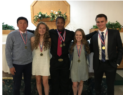
Multiple student-athletes received awards at the CHSL Scholar Athlete Banquet.