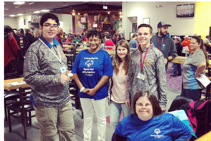
Catholic Athletes for Christ finished up its 3rd year with over 60 student-athletes in the club.