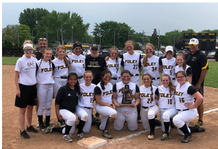
The softball team was also named district champions in the spring.